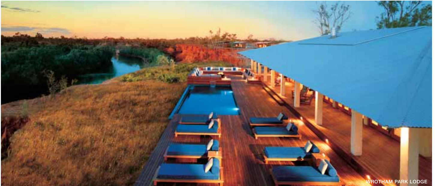
WROTHAM PARK LODGE