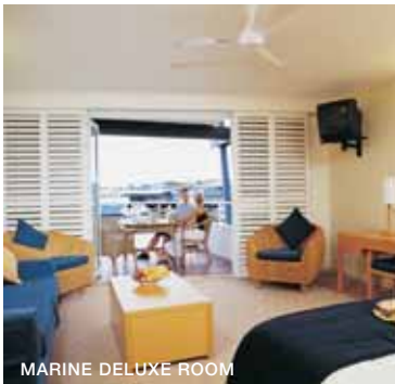
MARINE DELUXE ROOM