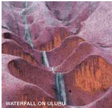
WATERFALL ON ULURU