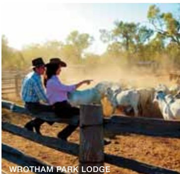
WROTHAM PARK LODGE