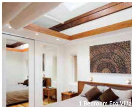
1 Bedroom Eco Villa

BASED ON 1 NIGHT STAY From $180 PER ROOM PER NIGHT*