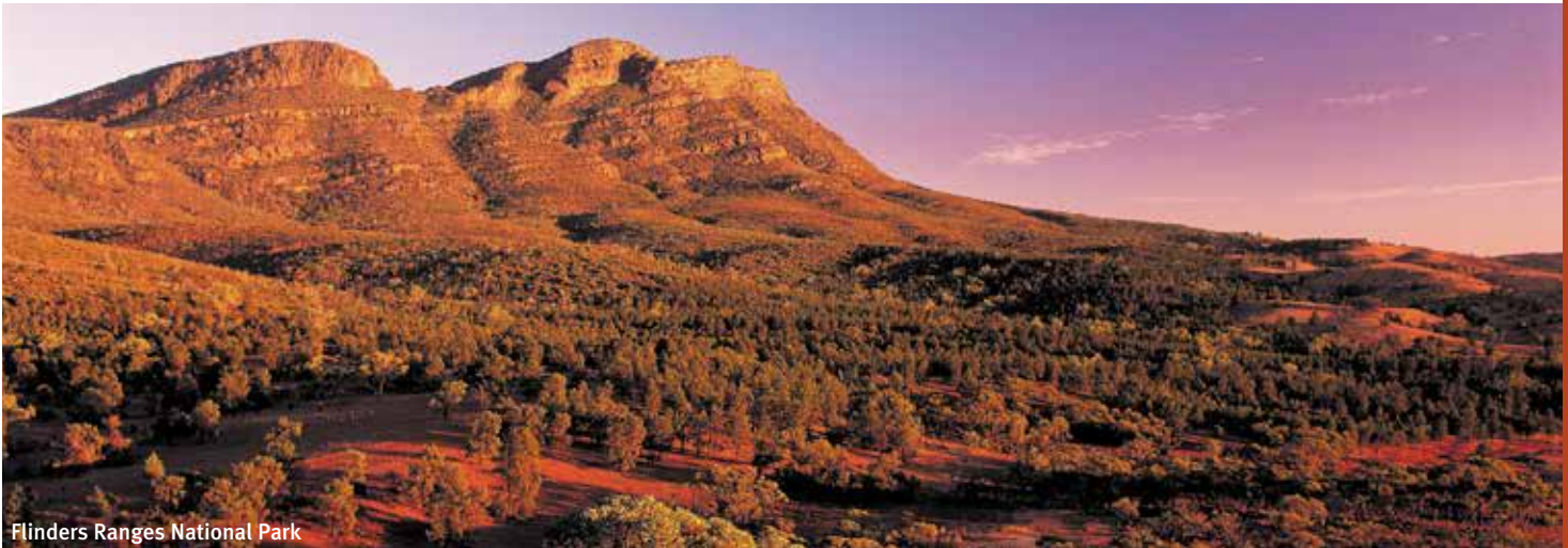
Flinders Ranges National Park