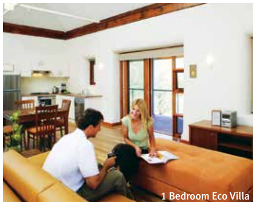
1 Bedroom Eco Villa